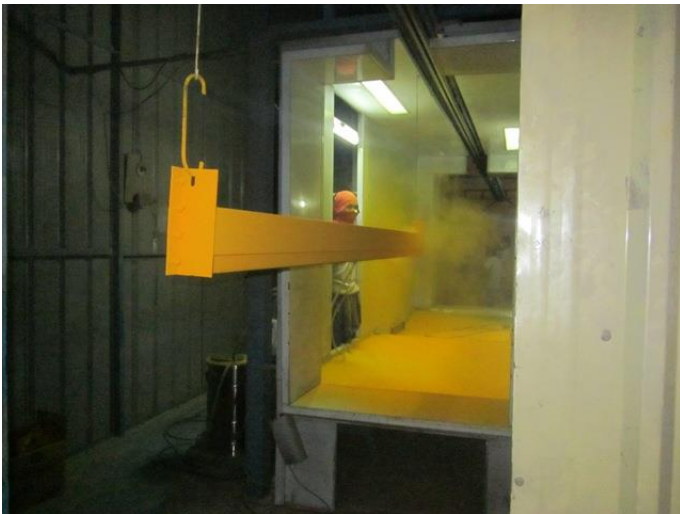
Conveyorized spray booth For smaller items (i.e. load beams & deck panels)