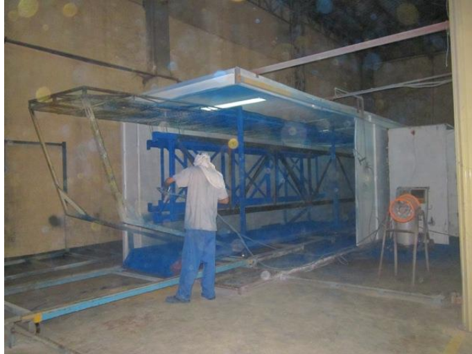
Spray booth for Upright Frame Using electrostatic spray gun