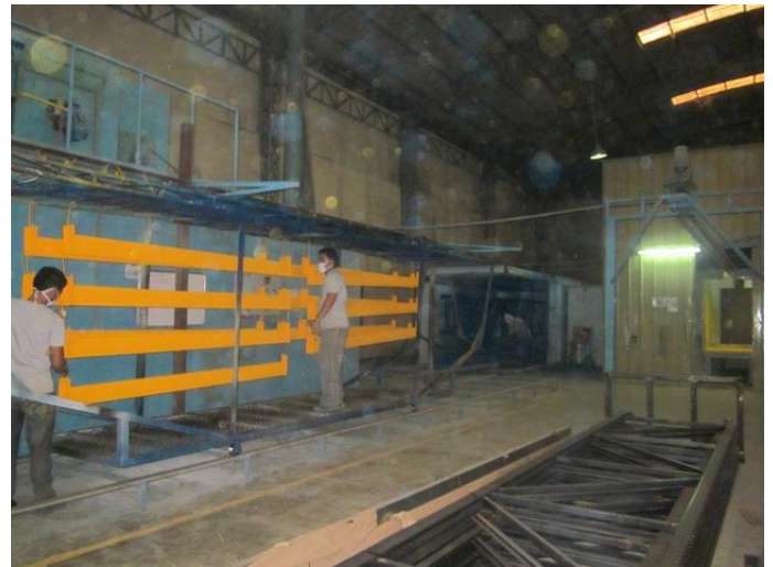
Loading Cart for powder coated Items prior to oven curing