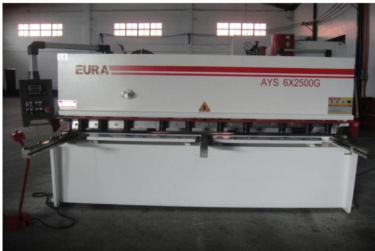
New Eura Hydraulic Swing Beam Shear