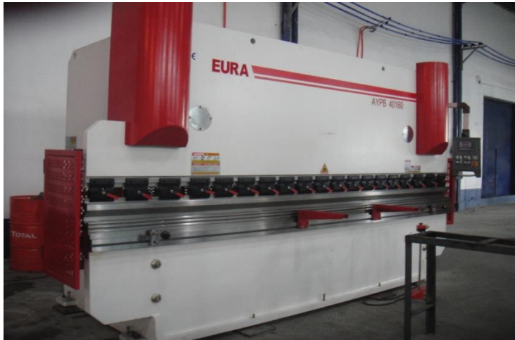
New Eura NC Hydraulic Press Brake